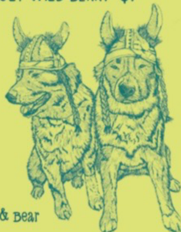
Fisher & Bear